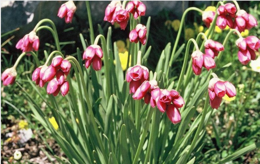
Randonnée Marguareis. Ail à fleurs de narcisse, ( Allium narcissiflorum), dans le Marguareis, (2550 m).