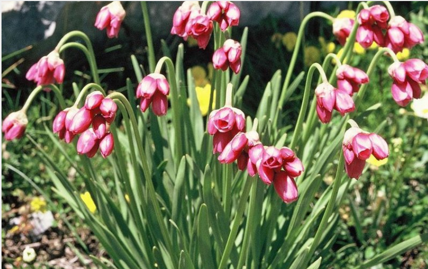
Randonnée Marguareis. Ail à fleurs de narcisse, ( Allium narcissiflorum), dans le Marguareis.