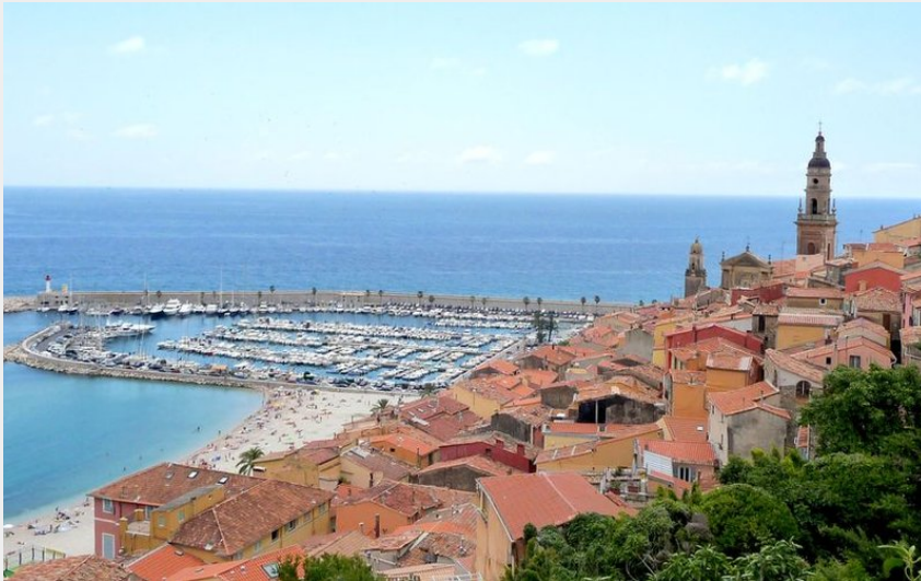
Randonnée au départ de Menton, vieille ville.