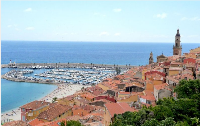
Randonnée au départ de Menton, vieille ville.