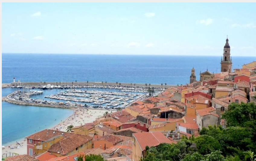
Randonnée au départ de Menton, vieille ville.