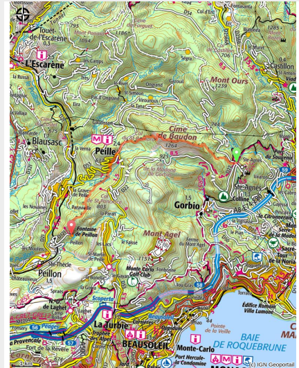
Randonnée balcon d'Azur. Jardin médiéval de Sainte-Agnès. (CRT Riviera Côte d'Azur)