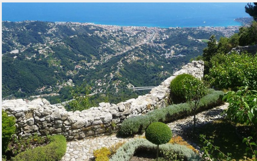
Randonnée balcon d'Azur. Jardin médiéval de Sainte-Agnès.