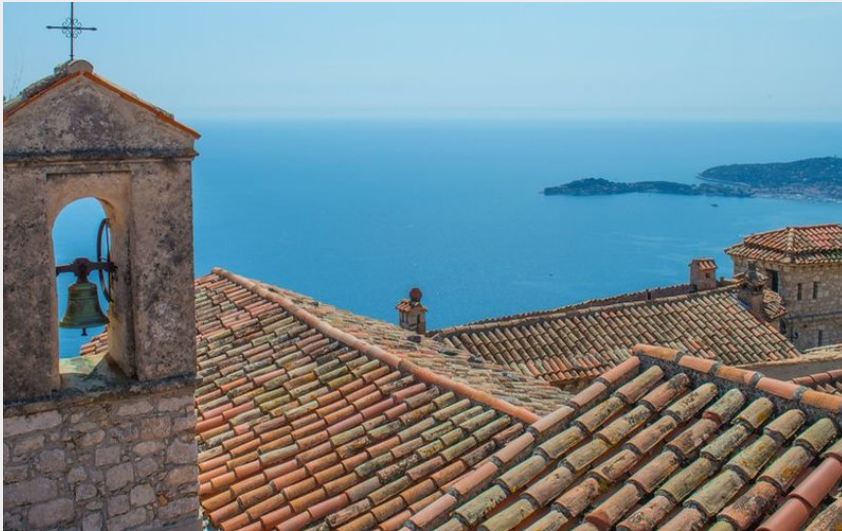
Randonnée Menton - Eze