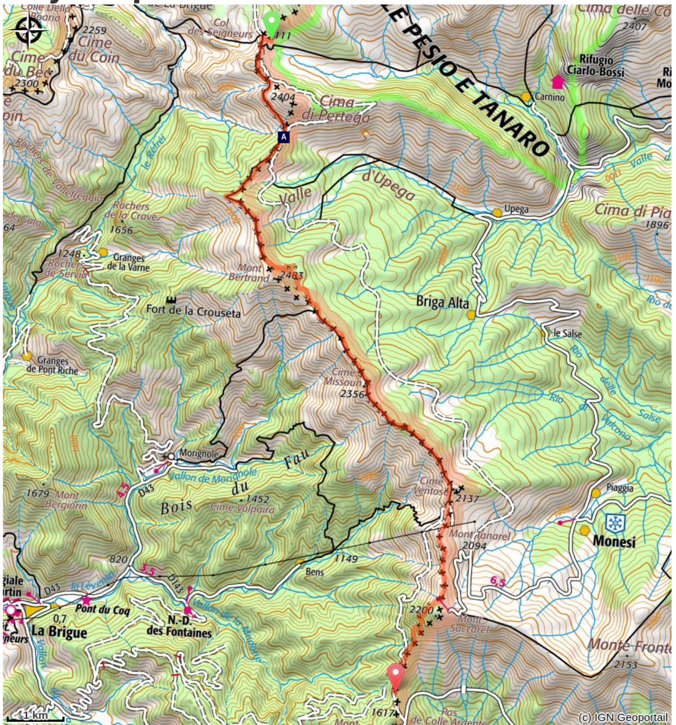
🏔 The Colle delle Selle Vecchie (A)