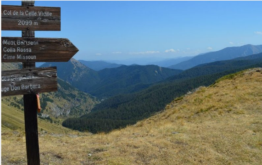
Col de la Celle Vieille (Fabrice Henon)