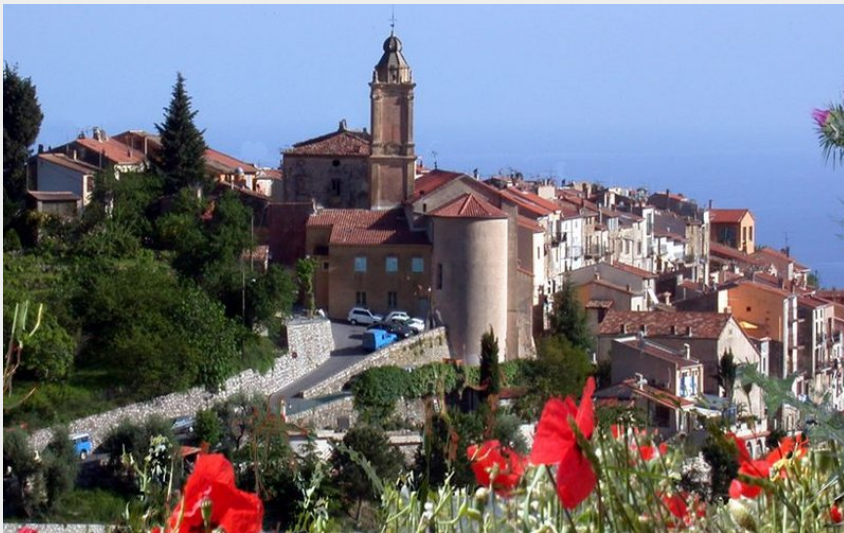
Randonnée Bévéra. Castellar (Mairie de Castellar)