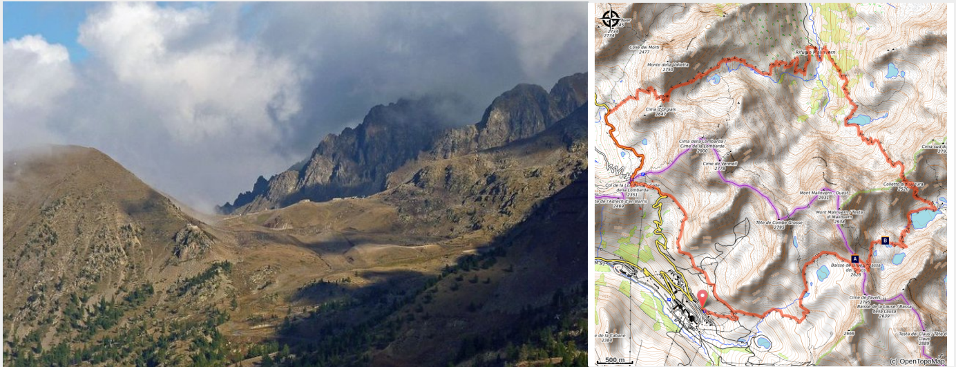
Randonnée Isola. Le col de la Lombarde, (2351 m), ennuagé sur le versant d'Isola en début d'automne.

The many lakes, ensconced in glacial cirques, invite to take a break and admire them. The peaks of the slender summits are reflected in the still waters of the lakes.