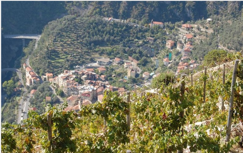
Airole et vignes (Commune d'Airole)