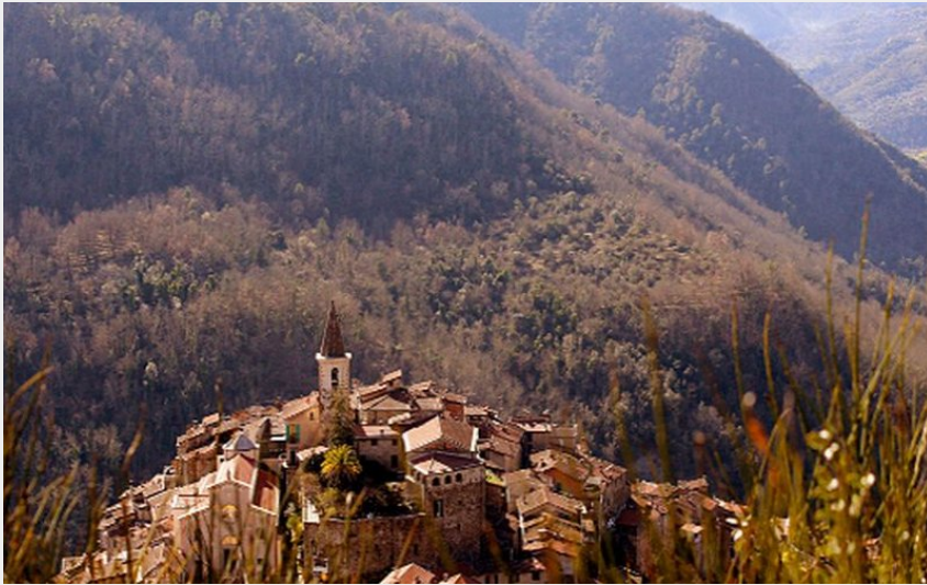
Apricale (Commune d'Apricale)