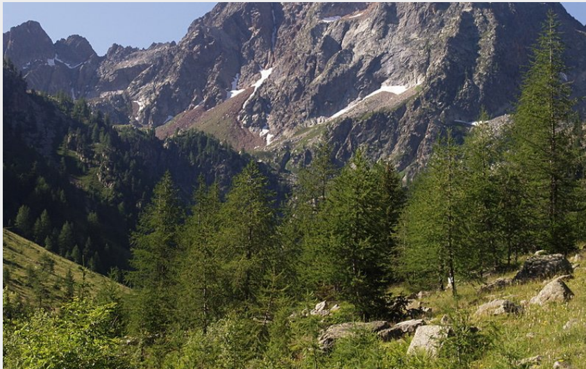
Il Monte Malinvern alla testata del Vallone di Riofreddo (Roberto Pockaj)