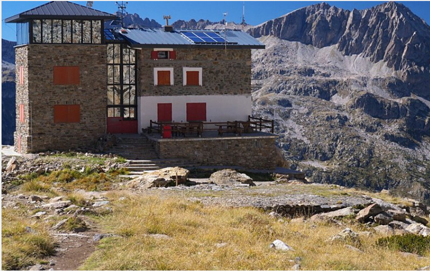
Il Rifugio Remondino (Roberto Pockaj)