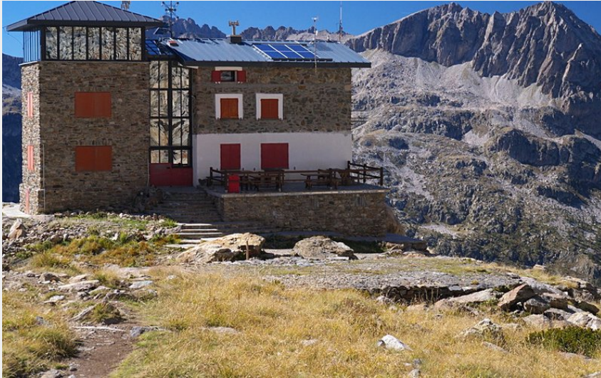
Il Rifugio Remondino (Roberto Pockaj)