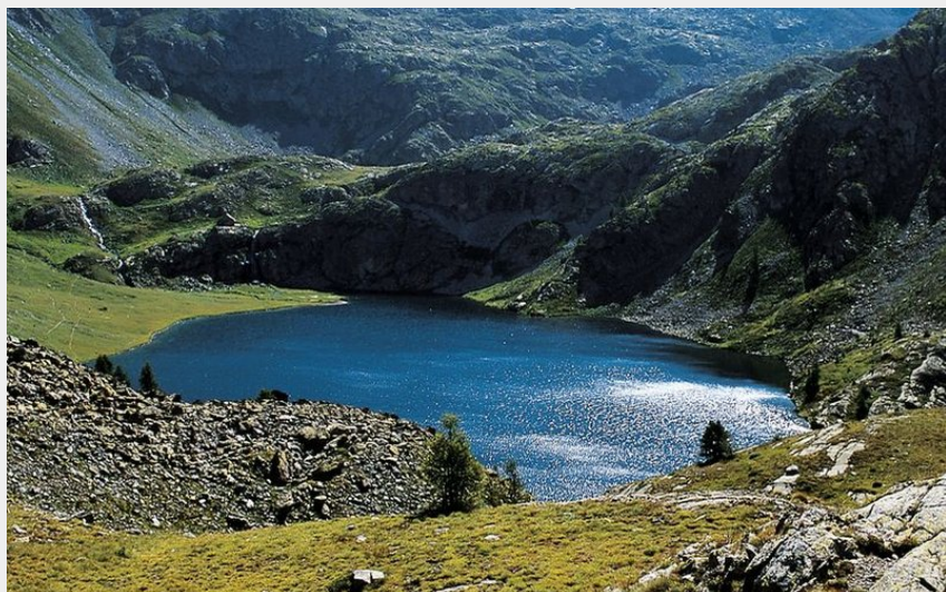
Lac de Vens (2380 m), son refuge, au fond à droite la brèche Borgogno (2944 m) (Eric LE BOUTEILLER )