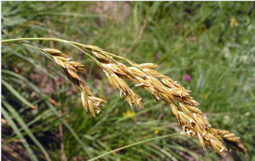
Fétuque paniculée, ( Festuca paniculata), en espèce très courante dans la pelouse subalpine.