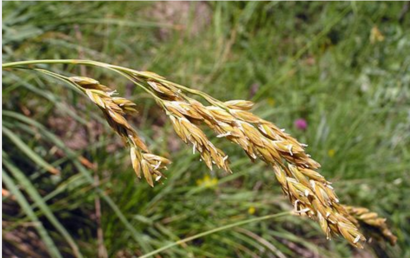
Fétuque paniculée, ( Festuca paniculata), en espèce très courante dans la pelouse subalpine.